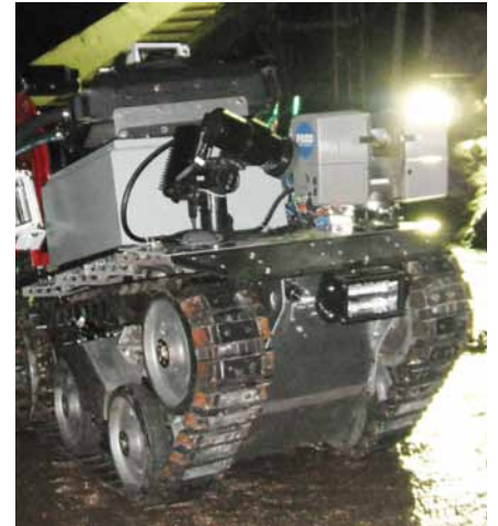
Above: The Hibbard Long Range Crawler