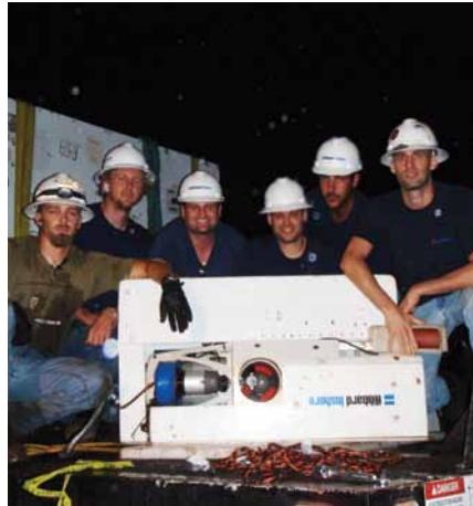
Above: The Hibbard Long Range Navajo photographed with crew

Further details on the systems included here can be found on the company website at: http://hibbardinshore.com