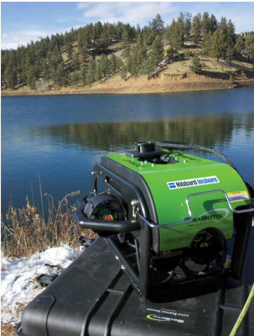
Left: The Hibbard LBV 600 Below: The Hibbard Long Tunnel AUV remotely operated vehicle

In addition to these two ROV systems, Hibbard Inshore has recently added a third swimming option to its long range fleet – the Saab Hybrid AUV/ROV. This vehicle is unique in that it is the first of its kind outfitted for extremely long range tunnel inspections. The vehicle can run in either AUV mode or ROV mode meaning that it can follow a pre-programmed route or take real-time control commands from an operator. With the power of an AUV and the control of an ROV, this vehicle can perform tunnel inspections out to 20+ km while supplying real-time data. It is able to stop and hover like a traditional ROV and can carry the